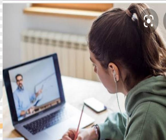
Students are keenly listening to faculty lecture on Ice Functional English and Speaking Skills